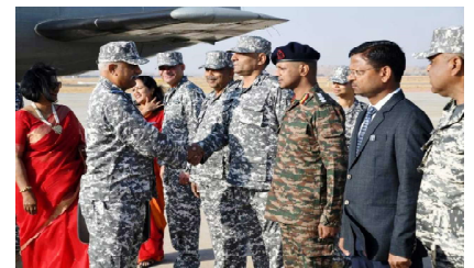
Air Marshal Vikram Singh, AOC-in-C, SWAC, at Jaisalmer Air Force Station.

The airfield at Jaisalmer was started as No. 14 Care and Maintenance Units in 1970. After the 1971 war, it was upgraded and 4 Forward Base Support